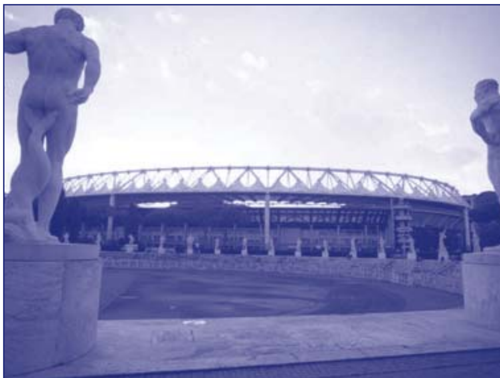
Stadio Olimpico Rome (ITA)

PLEASE REMEMBER ! Preliminary entries due by 15 April 2004