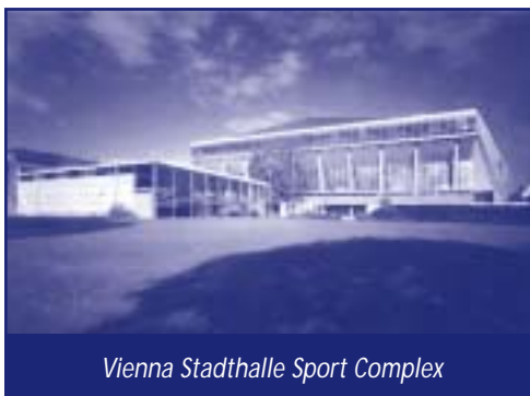
Vienna Stadthalle Sport Complex