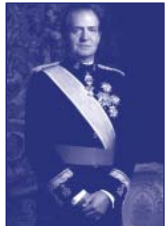
His Majesty King Juan Carlos I President of the Committee of Honour of Madrid 2004 European Swimming Championships

ing groups for each discipline. In addition, LEN's newly appointed Public Relations Agency BELL POTTINGER is acting jointly with the Spanish Organising Committee Press and Public Relations company TINKLE to ensure the world's media are catered for with professionalism and to ensure the championships and our European athletes are widely promoted. With such combined expertise, both in event management and promotion, the European Swimming Championships of LEN 2004 have a great air of expectancy about them.