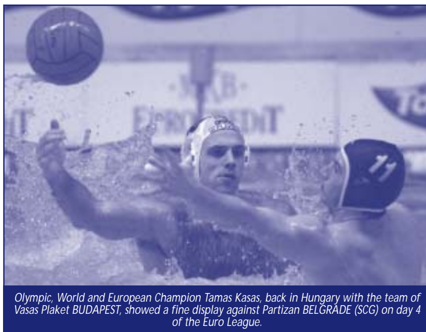
Olympic, World and European Champion Tamas Kasas, back in Hungary with the team of Vasas Plaket BUDAPEST, showed a fine display against Partizan BELGRADE (SCG) on day 4 of the Euro League.